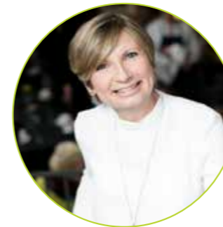
Liz Yeates CEO

Every year there are 43,000 people diagnosed with cancer in Ireland and on the basis of current projections, another 500,000 Irish people will be diagnosed with cancer over the next ten years. Furthermore there are an estimated 180,000 cancer survivors living in Ireland who continue to need support.