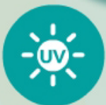
Overexposure to UV light